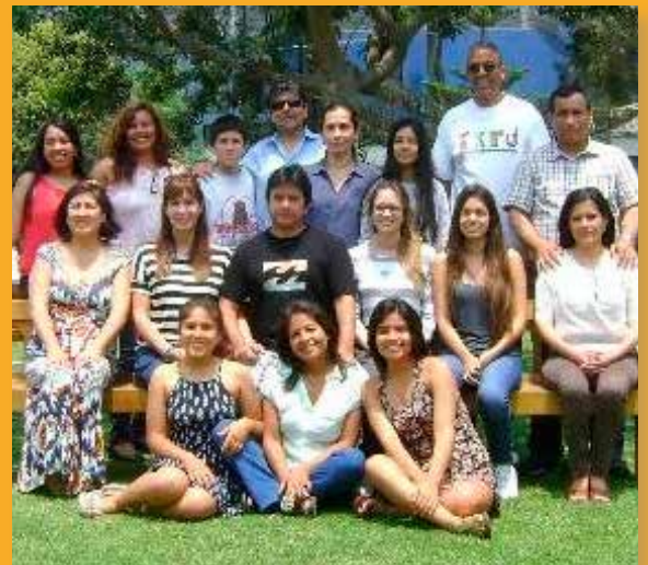
Community Mercy in Action, Lima Perú