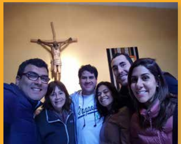
José Kuwae Community, Lima Perú

Given the intense activity of their members, the JK have already become accustomed to a rather sui generis dynamic: they meet approximately every two months, but not on previously agreed dates or according to a precise frequency, but when one of the members summons the others, feeling the need for listening, support, the discernment and prayer of the community; in other words, when they ask for it, the community meets immediately (usually on the same day). On the other hand, each morning communicates through their WhatsApp group to ask each other how they are, and thus be accompanied and strengthen each other.