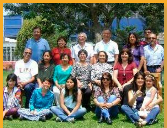
Father Eustachian Community, Lima Perú

After a few months of very frequent meetings, the community has lowered the frequency a bit. Currently, they are meeting once a month, always virtually. Of course, the topics that were proposed and programmed at the beginning of the year continue to be worked on, very consistently. In their last meeting, they worked on the theme of death: what is the Christian vision of it, the different ways of processing it when it happens to someone close, the importance of preparing for that moment. Next month they will have their Christmas reunion together with the community Mercy in Action.