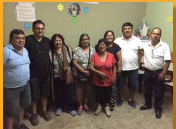
Marcel Tregouet Community, Lima Perú