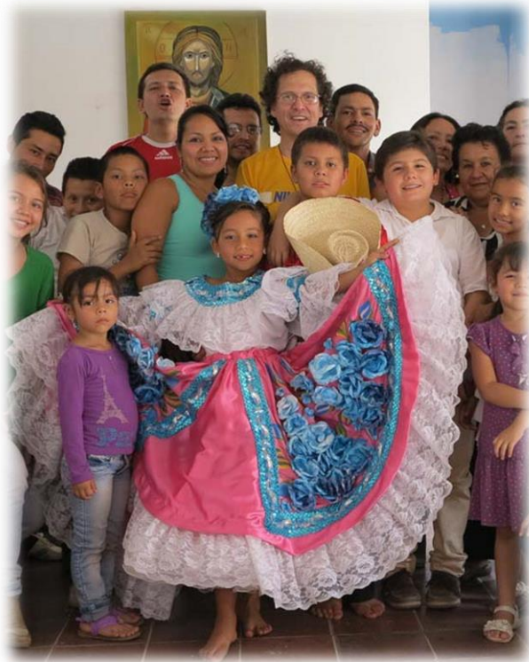
Algeciras (Colombia) June 8, 2014