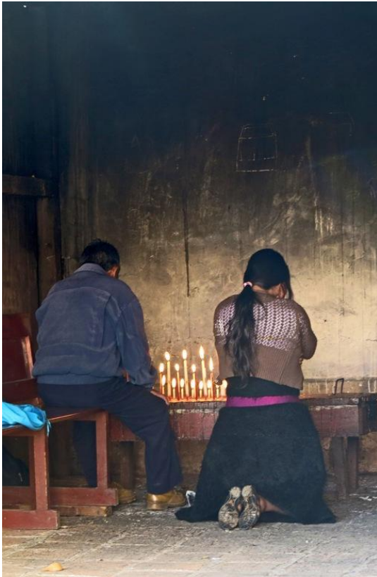
A couple praying in San Cristóbal de las Casas Chiapas - Mexico

Fear not, in those solitary conversations, talking of your miseries, of your fears, of your aggravation, of the people you love, of your projects and of your hopes; do it confidently and with an open heart.